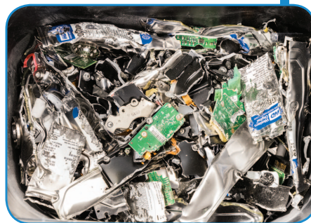
Shredded particles fall into the molded plastic waste bin for easy storage and disposal

Formax - New Hampshire, USA www.formax.com Local Dealer: