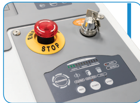
LED control panel, safety key lock and large emergency stop button