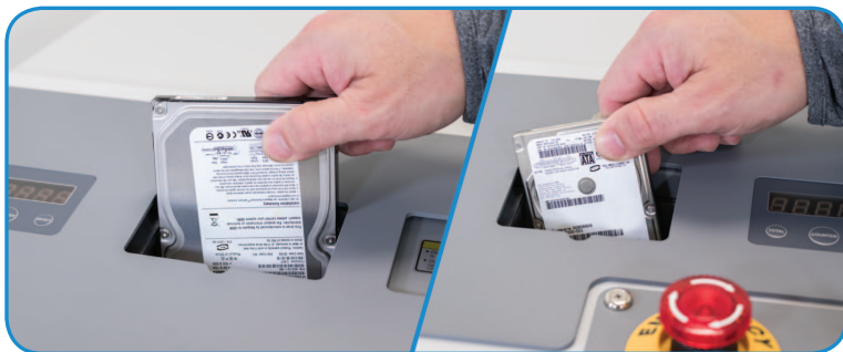
Separate shredding chambers sized for desktop and laptop hard drives, each with sliding metal safety shields and resettable LED counters

1-Year Warranty on cutting head and all other parts