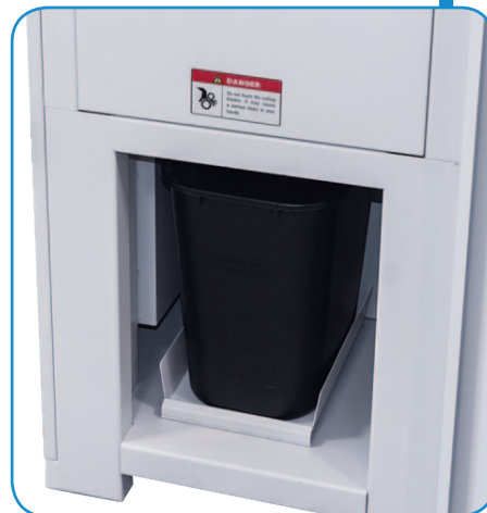
Rugged molded plastic waste bin for convenient storage and disposal